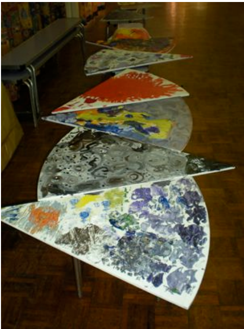
Wheel sections in progress